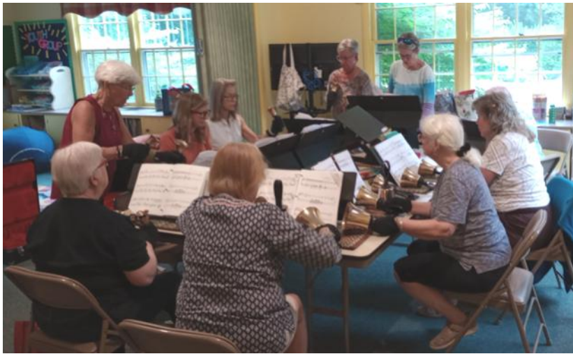
The Bell Choir rehearsing before taking Worcester by storm. The choir participated in the American Handbell Association's Festival/Conference, held June 26-29 at Worcester State University.