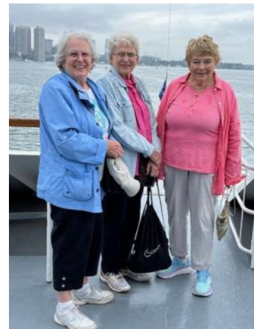
Roaming the high seas (well, Boston Harbor)