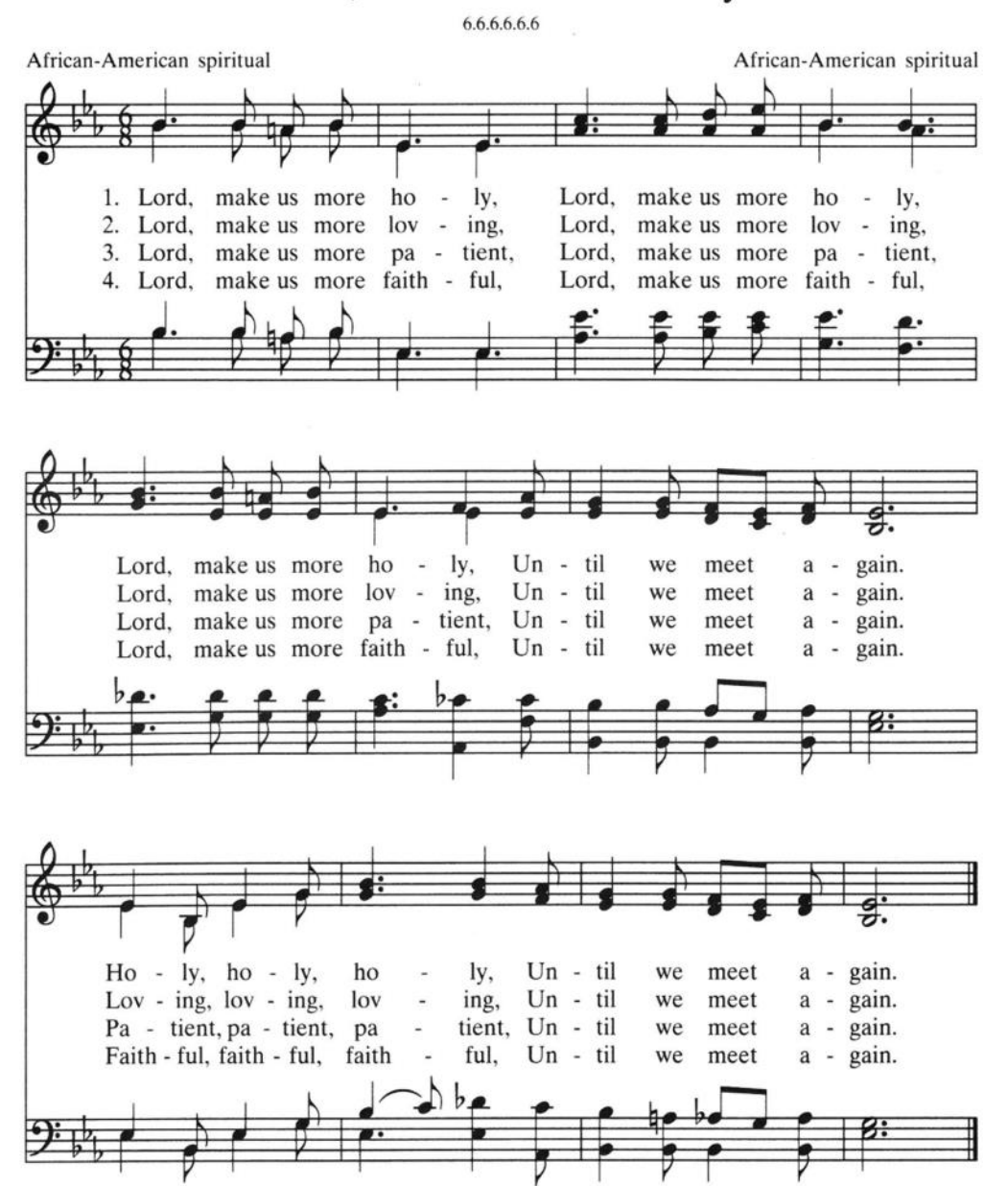
Hymns, Psalms, & Spiritual Songs (1990)