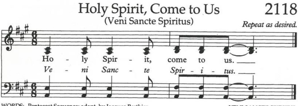
WORDS: Pentecost Sequence; adapt. by Jacques Berthier MUSIC: Jacques Berthier