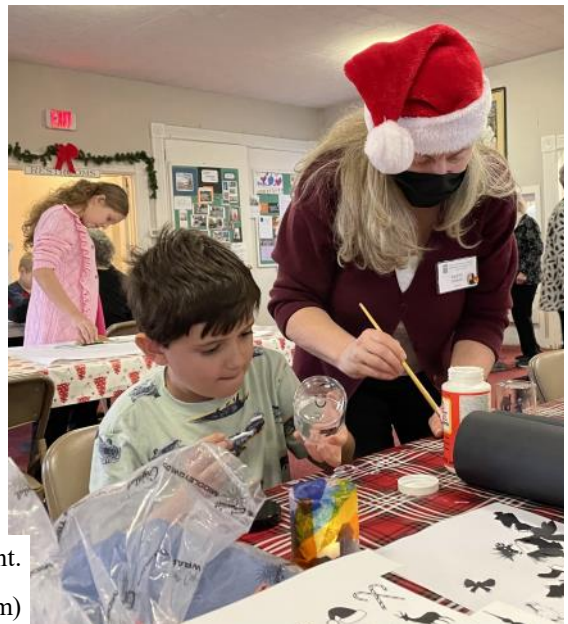
Flowers and sticks for Advent. Advent Craft Workshop (bottom)