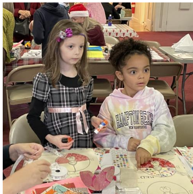
Advent Craft Workshop!

Readers are encouraged to acquire a copy on their own. Please reach out to the church office if you need assistance, we’d be glad to get a copy.