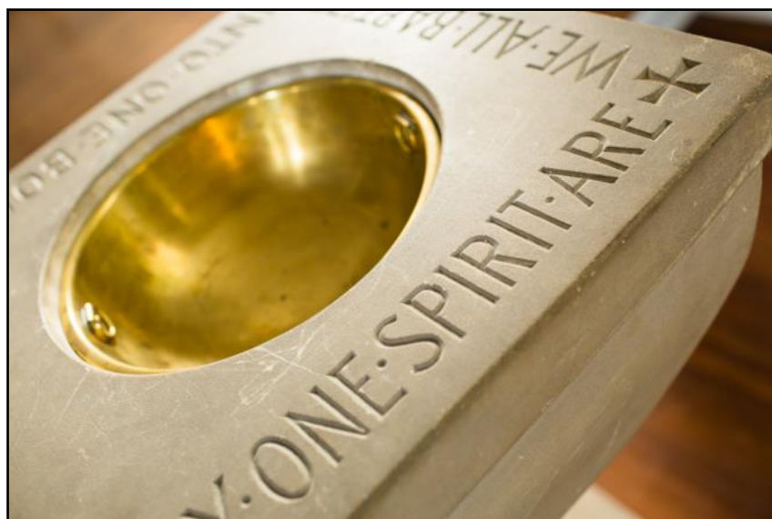
Baptismal font at First Congregational Church, Stockbridge