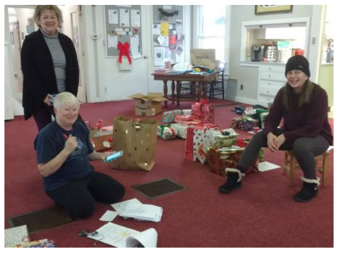
Giving Tree elves, 2019

We sent a directed donation of $800 to the Salvation Army in Pittsfield and $1000 to UCC Disaster Ministries/Outreach to help those impacted by the hurricane in