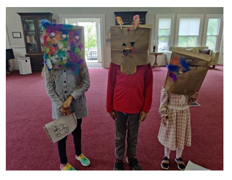
Sunday School students (we think!)