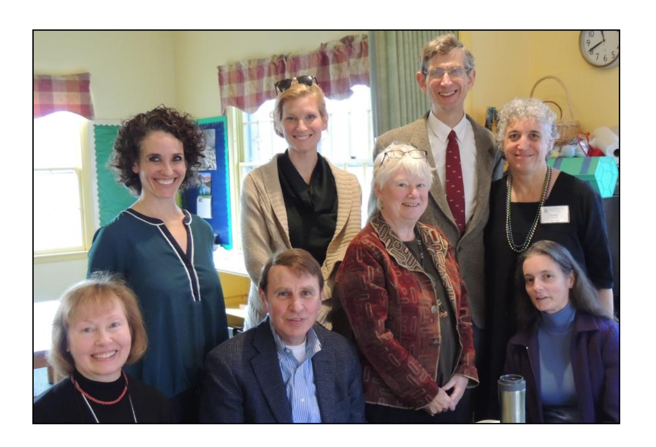
The First Congregational Church of the United Church of Christ Stockbridge, Massachusetts Christian Education Sunday June 20, 2021 10:00 a.m.